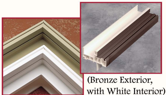
(Bronze Exterior, with White Interior)